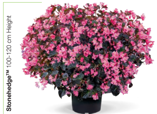
Stonehedge™ 100-120 cm Height