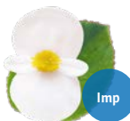
White Green Leaf C 4000P