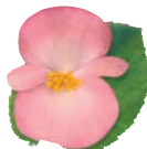
Pink Green Leaf C 4010P U.S. Patent No.: 9,295,208