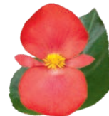
Red Green Leaf C 4022P