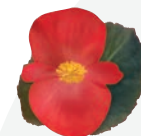
Red Bronze Leaf C 4140P