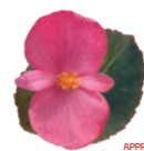
Deep Rose Bronze Leaf C 4040P