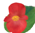
Red Green Leaf C 4020P U.S. Patent No.: 9,955,637