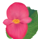
Rose Green Leaf C 4030P U.S. Patent No.: 9,295,209