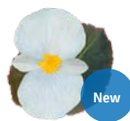
White Bronze Leaf C 4003P