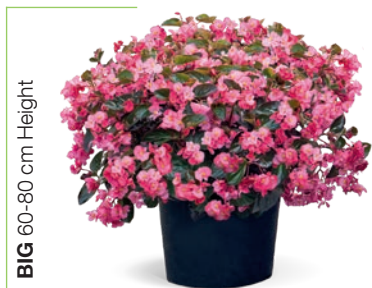
BIG 60-80 cm Height