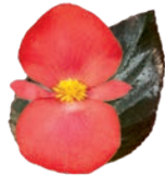
Red Bronze Leaf C 4142P U.S. Patent No.: 9,949,454