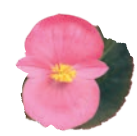
Rose Bronze Leaf C 4130P