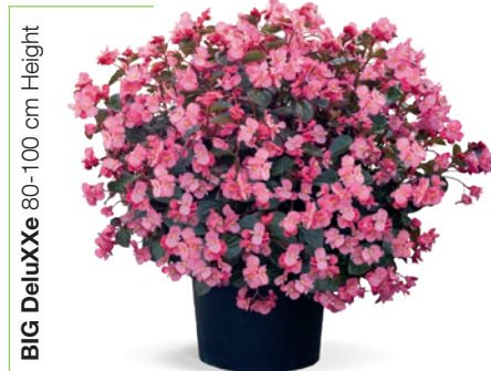
BIG DeluXXe 80-100 cm Height