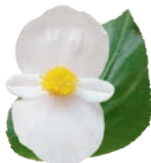
White Green Leaf C 4050P