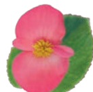
Deep Pink Green Leaf C 4011P