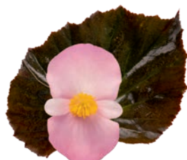
Light Pink Bronze Leaf C 4185P