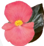
Rose Bronze Leaf C 4132P