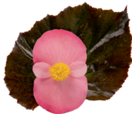
Rose Bronze Leaf C 4195P