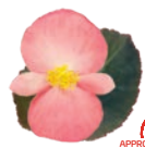
Pink Bronze Leaf C 4015P