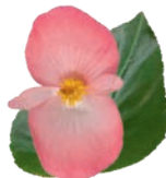
Pink Green Leaf C 4112P