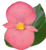
Rose Green Leaf C 4012P U.S. Patent No.: 9,949,454